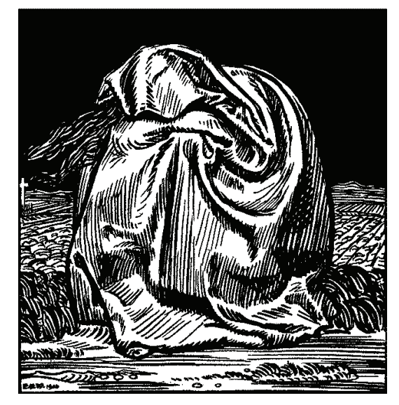
As a literal veil can conceal the light of the sun, so can a spiritual veil—such as apathy or attachment to a name or to one's comfort zone—conceal the light of truth.